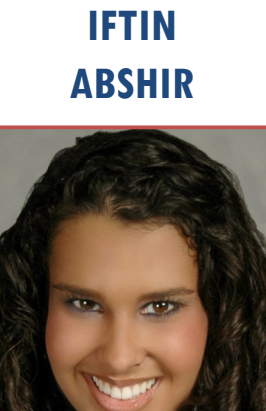
Chemistry, BS & Screenwriting, BA 2015