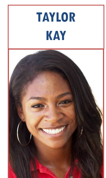
Urban Studies, BA 2015