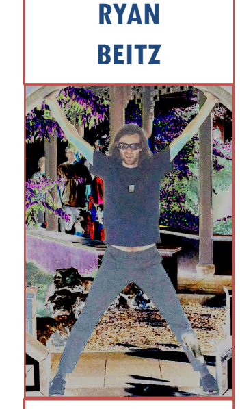
Philosophy, MA 2016