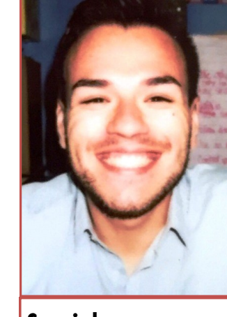
Special Education, MA 2016