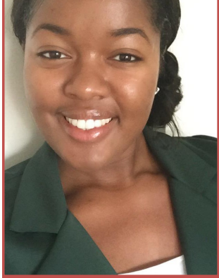
Chemistry, BS 2016